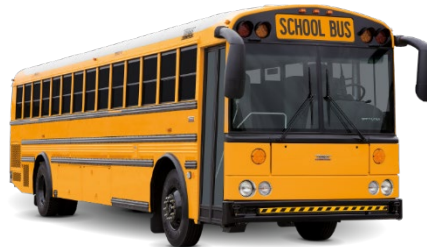
Rear Engine Style