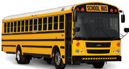
Front Engine Style

A Type D school bus is a body installed upon a chassis, with the engine mounted in the front, mid bus, or rear with a gross vehicle weight rating of more than 10,000 pounds. The engine may be behind the windshield and beside the driver's seat; it may be at the rear of the bus, behind the rear wheels; or between the front and rear axles. The entrance door is ahead of the front wheels. This type is also known as "transit-style school bus."